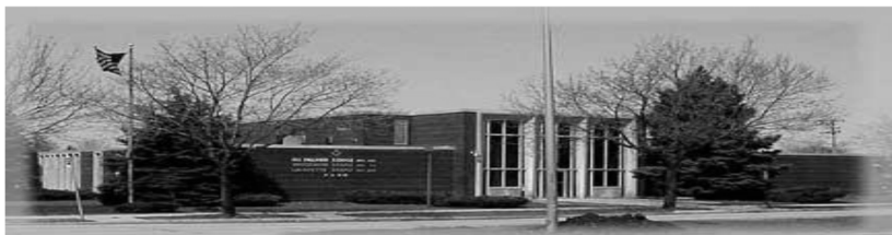
January 2017 – Volume 33, Issue 1

4315 North 92 nd Street, Wauwatosa, WI 53222 – (414) 463-8390