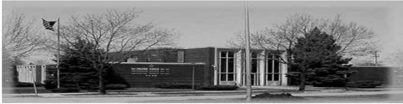
December 2016 - Volume 32, Issue 10

Non-Profit Organization U.S. Postage PAID Milwaukee, WI Permit no. 266